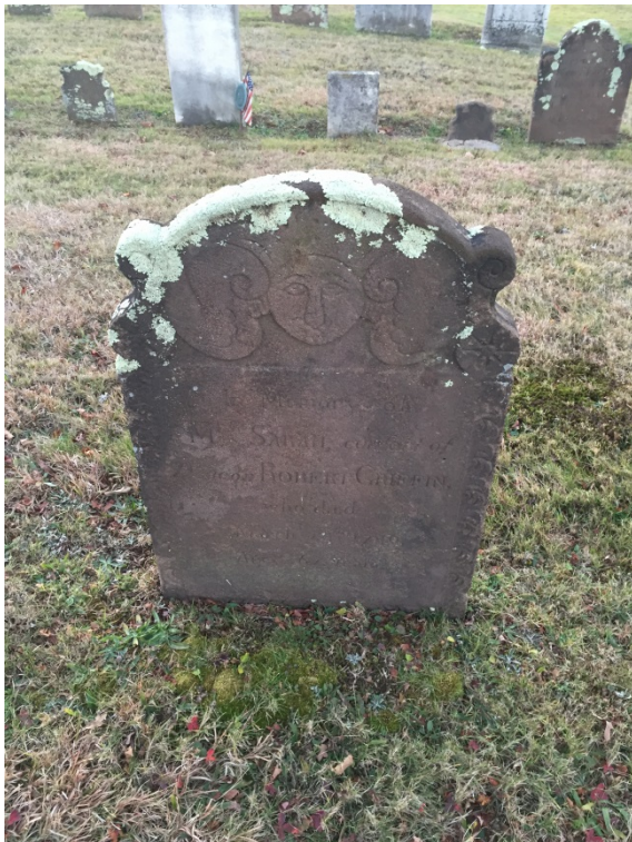
Close-up of cherub head