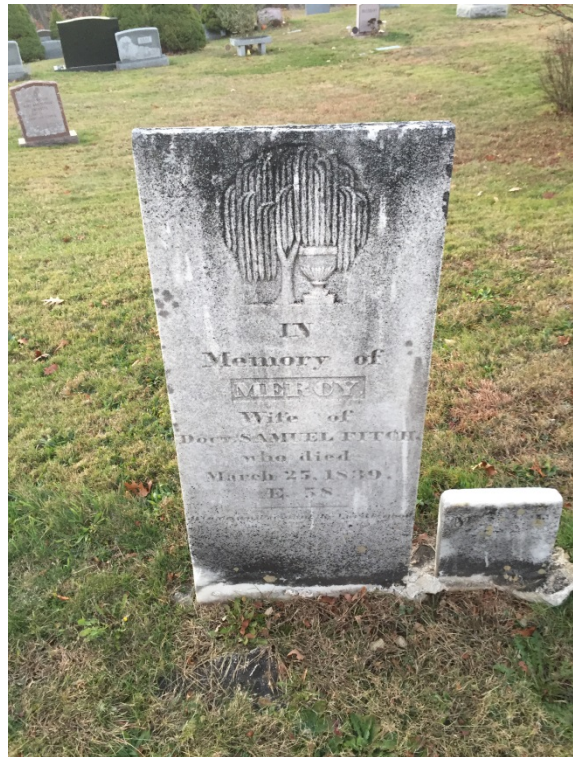
Close-up of willow tree and urn