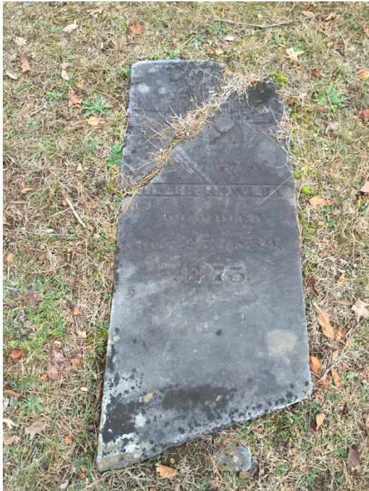
Close-up of fallen headstone