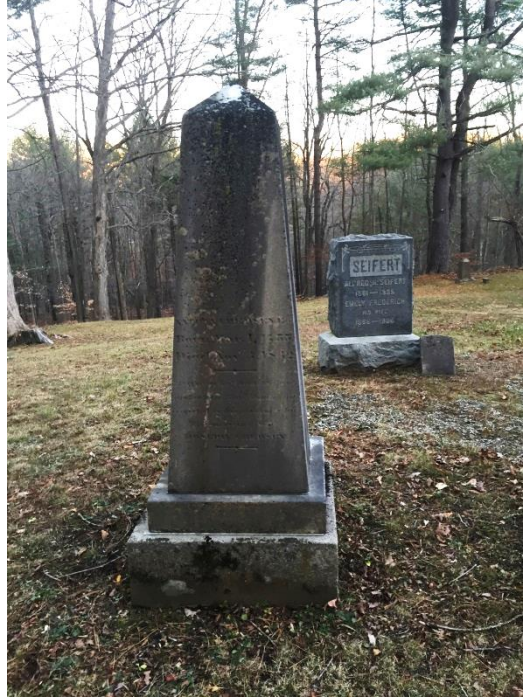
Close-up of an obelisk