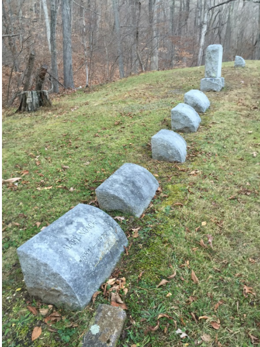
Noack family plot