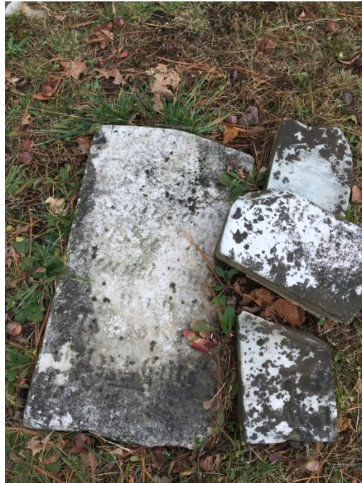
Close-up of fallen headstones in pieces